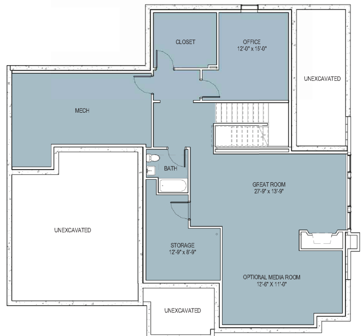
Lower Level Finished